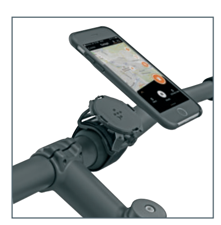
Mounting position handlebar