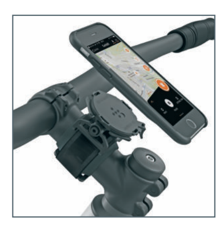
Mounting position stem