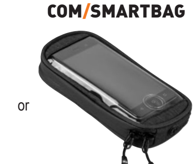
available covers at: sks-germany.com